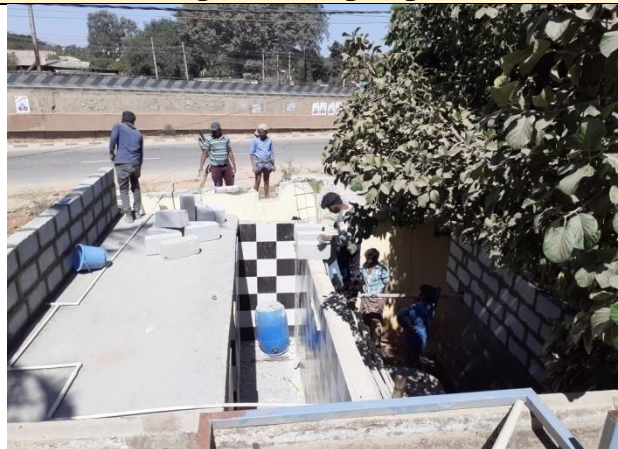
After Removing the Toilet Roof