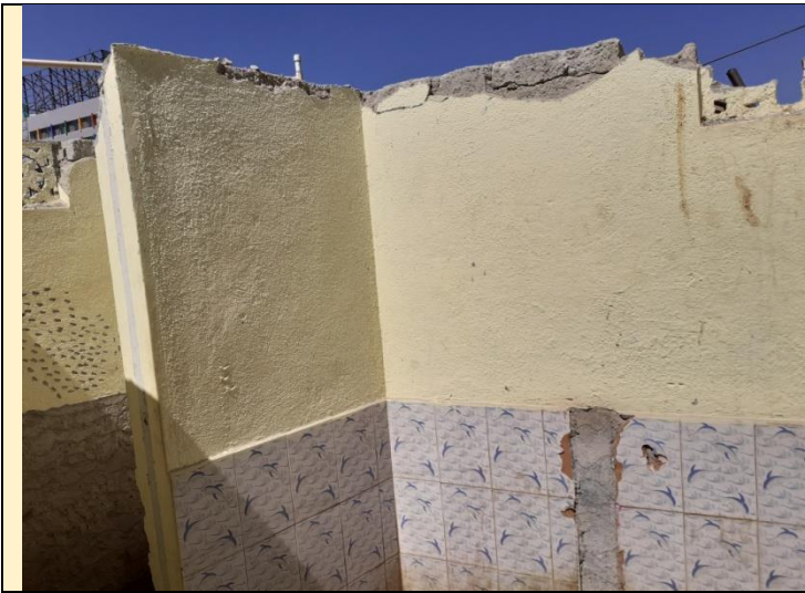
Before without Tiles in Toilet