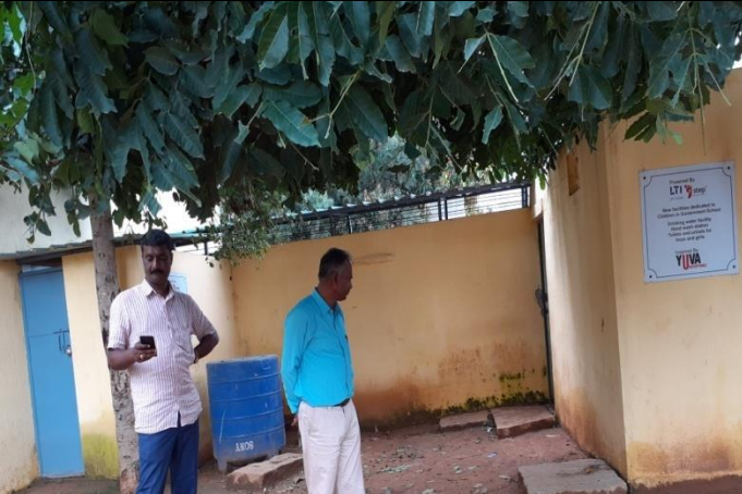
Before -Toilet Roof