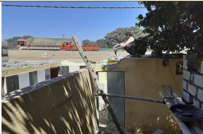
After Removing the Toilet Roof