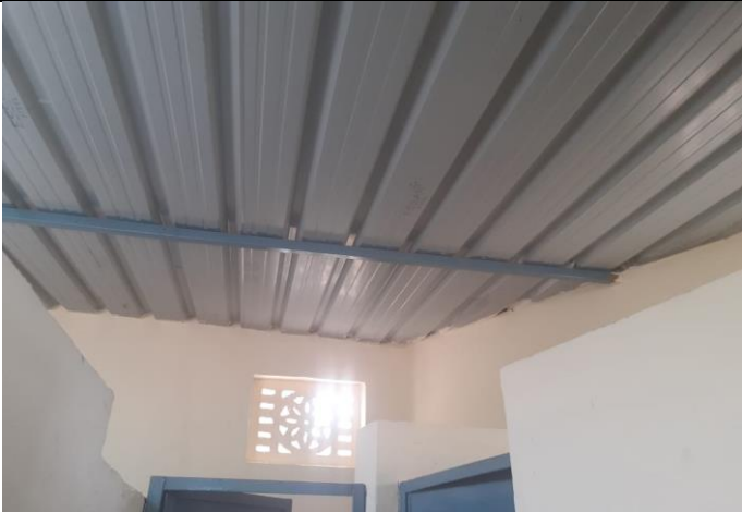
Raised Height of wall of Toilets