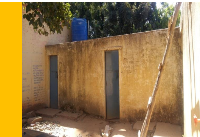
Before Removing and raising height of Toilet Roof: