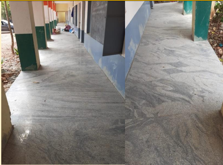
After laying Granite