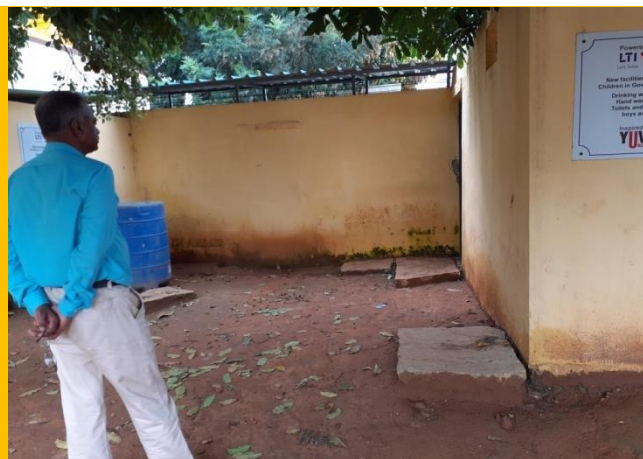
Before Removing and raising height of Toilet Roof: