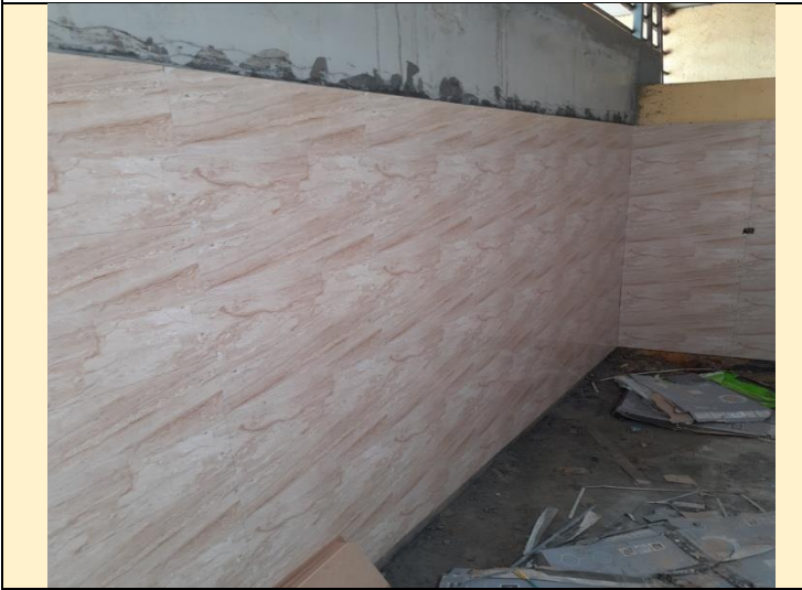
After Tiles to Walls and Floors