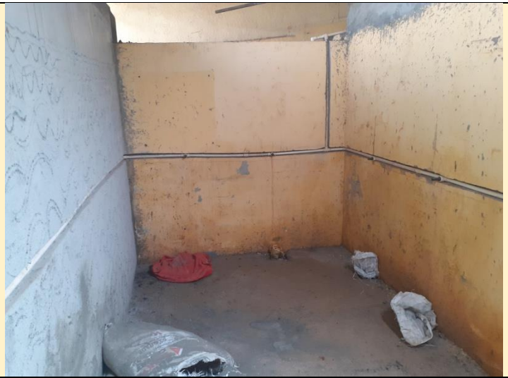
After Tiles to walls and floors