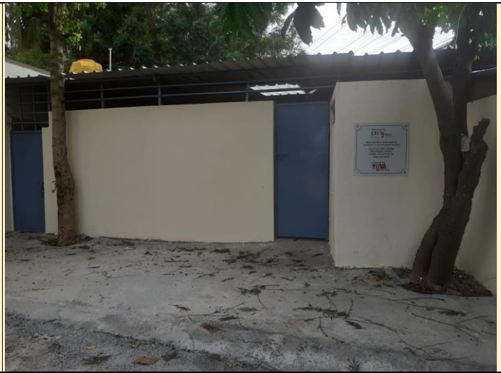
After Iron Doors and Ventilators