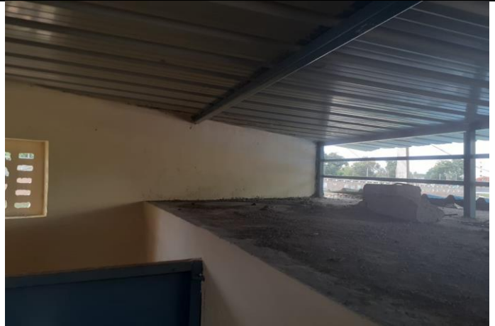
Raised Height of wall of Toilets