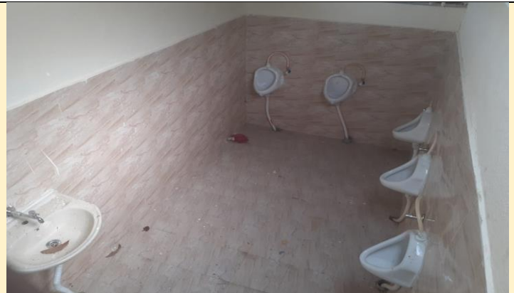
New Urinal Division