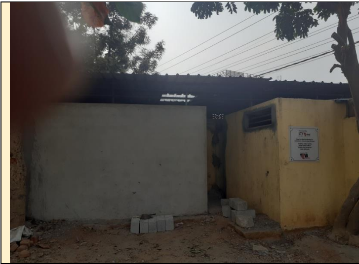
Providing iron doors and ventilating widows