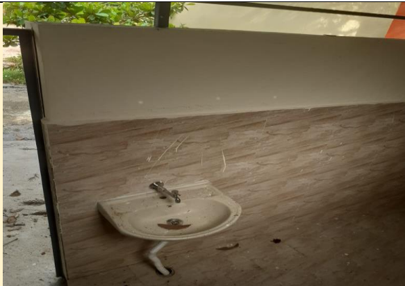
New Hand Wash