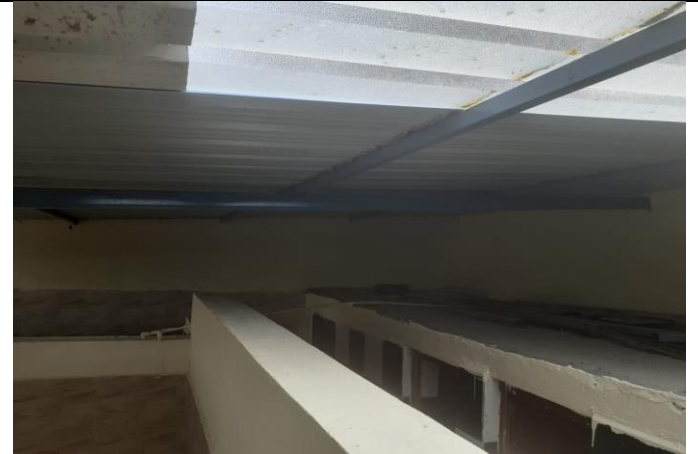
After -New Sheet with one Transparent Sheets for Roof